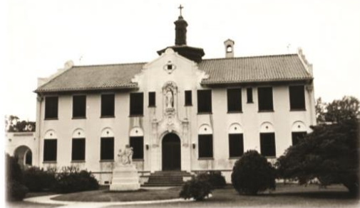
St. Mary's Home