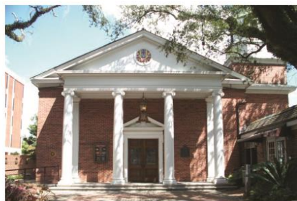
Our Lady of Wisdom Church & Student Center