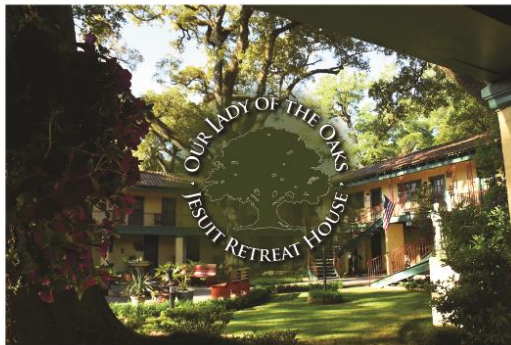
Our Lady of the Oaks Retreat Center